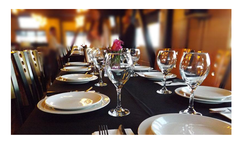
Proceeds will help pay for grants provided to hopeful, adoptive parents and adoption-related educational & promotional materials.